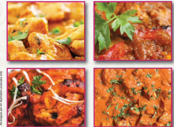
All images are for illustration purposes only